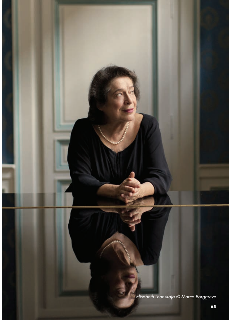
Elisabeth Leonskaja