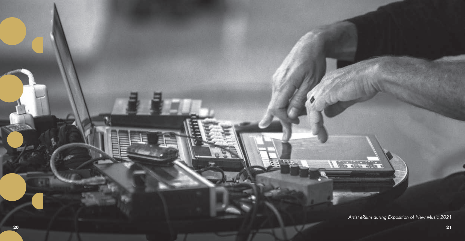
Artist eRikm during Exposition of New Music 2021