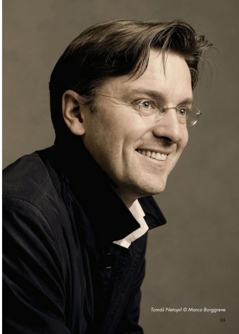
Tomáš Netopil